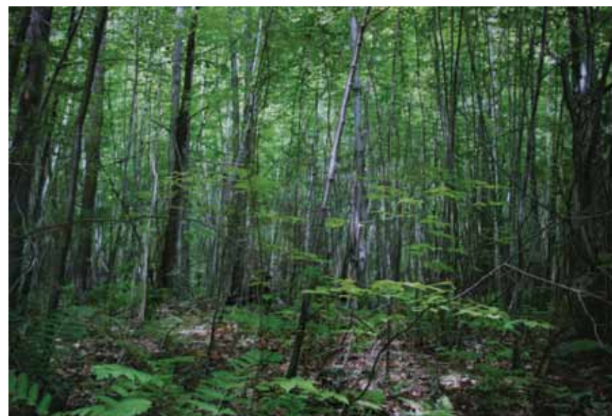
Minnechoag Mountain: Sapling Grove , 2008, handcut digital C print, 20 x 30 inches.