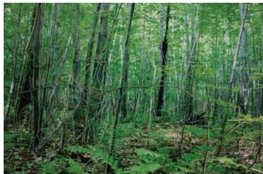
Minnechoag Mountain: View from Right of Way , 2009, handcut digital C print, 4 x 6 inches.

Rochester Art Center programs are made possible in part by a grant from the Minnesota State Arts Board through an appropriation by the Minnesota State Legislature and a grant from the National Endowment for the Arts. Major support is also provided by the McKnight Foundation and the City of Rochester.